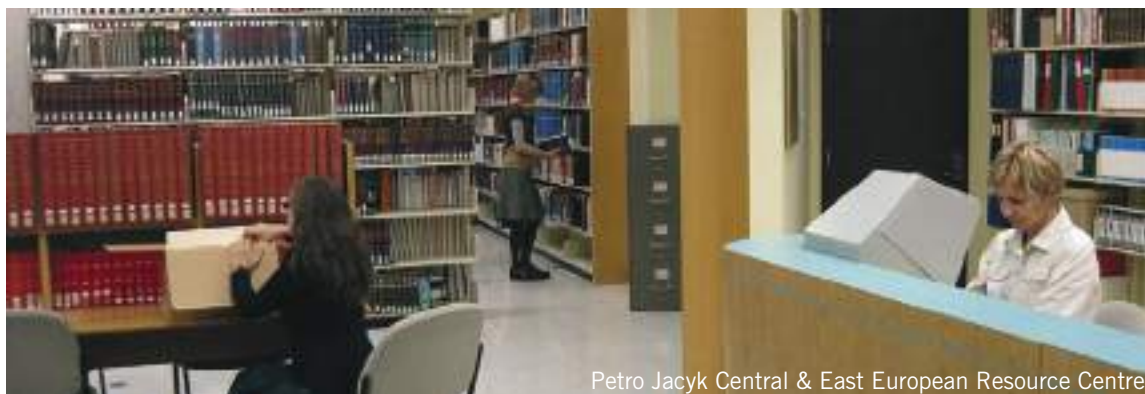
Petro Jacyk Central & East European Resource Centre

The Pontifical Institute of Mediaeval Studies Library houses the major collection in mediaeval studies on campus with 96,899 titles of printed books and another 20,000 printed and manuscript books in microform. In addition, the Library's collection of rare books numbers 2,400 books (39 incunabula, ca. 12 unica); 25 manuscripts; 50 single manuscript pages; and ca. 200 parchment documents. Priority in collection development at the Institute Library is given to editions of texts and archival materials and to catalogues of manuscripts held in libraries around the world. There is a special strength in mediaeval