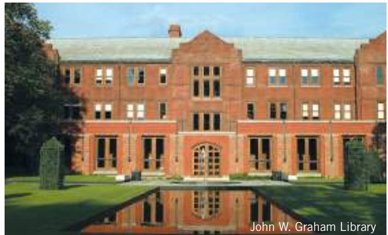
John W. Graham Library

The greatest strengths of the Library are in the fields of Canadian, British, European and Caribbean literature, theology, philosophy, the history of science and medicine, Canadiana, Hebraica and Judaica, as well as the history and art of the book. The Library is committed to making its unique resources freely available through customized digitization projects, and through social media such as Flickr. Faculty are welcome to conduct classes in our seminar room,