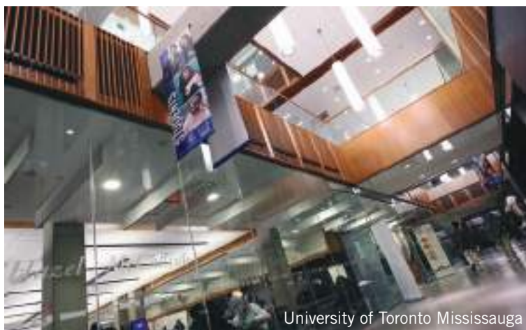
University of Toronto Mississauga

Course materials can be placed on Reserve (Short Term Loan), including course notes, sample tests and answers to assignments. Alternatively, you may send reading lists to reserves.utm@utoronto.ca and we will provide you with durable links to these readings for uploading to your Portal course shells. Final