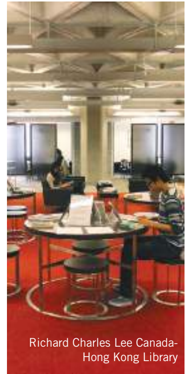
Richard Charles Lee Canada-Hong Kong Library

Robarts Library offers a range of hands-on sessions on using key online search tools in social sciences and humanities research. This program includes drop-in sessions and sessions specifically geared to faculty and graduate students. Customized instruction sessions tailored to the needs of your classes and tutorial sections are also available upon request.