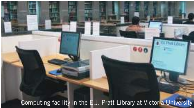
Computing facility in the E.J. Pratt Library at Victoria University

students. When you access our online resources from off campus, you will need to provide your UTORid or your library card barcode and PIN which can be found on your TCard.