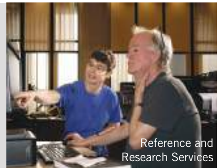
Reference and Research Services