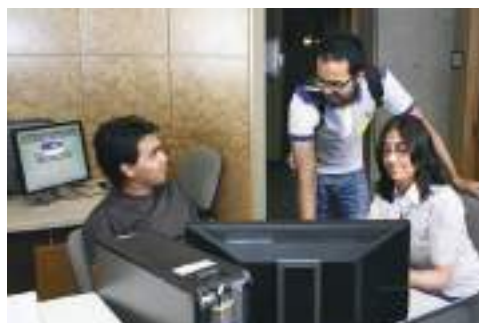
Clockwise from top left: Gerstein Science Information Centre, Information Technology Services and OCUL Scholars Portal staff, Library Instruction, Information Commons Help Desk, Robarts Library