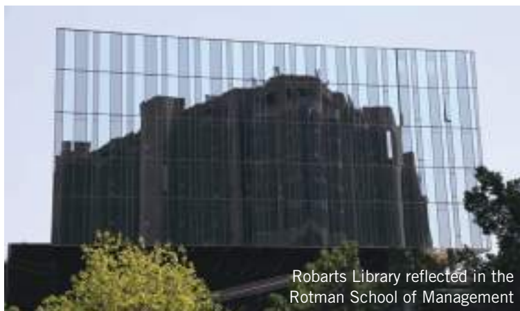
Robarts Library reflected in the Rotman School of Management

The John M. Kelly Library's print collection of over 300,000 volumes is developed in support of undergraduate programs in the Faculty of Arts and Science, graduate programs in the Faculty of Theology and programs of the Continuing Education Division. The collection is particularly strong in the areas of philosophy, the history of Ireland, Celtic languages and literature, book and media studies, British and Canadian history, English literature and the history of