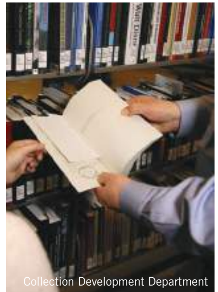
Collection Development Department

The use of copyrighted materials by members of the University of Toronto community is governed by the Canadian Copyright Act, individual licences for electronic materials negotiated directly with publishers, and the University's agreement