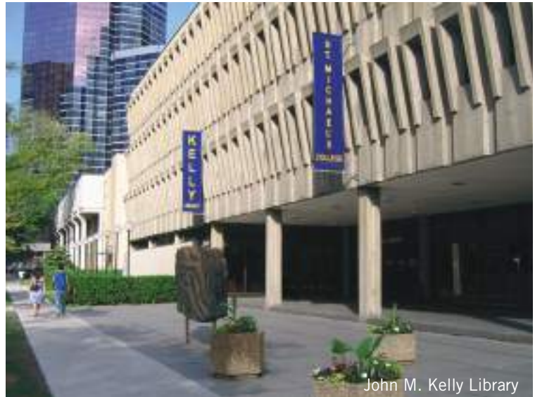
John M. Kelly Library