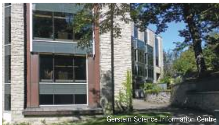
Gerstein Science Information Centre