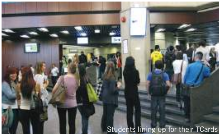
Students lining up for their TCards

The University of Toronto Libraries' wealth of online information resources is available twenty-four hours a day via the Libraries' website. The Libraries have licensed hundreds of thousands of online journals, books and databases for your free use as a member of the U of T community. Access to licensed e-resources is restricted to U of T faculty, staff and